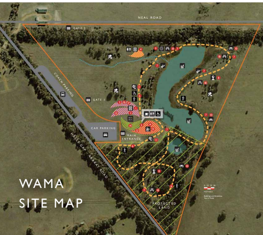
WAMA SITE MAP