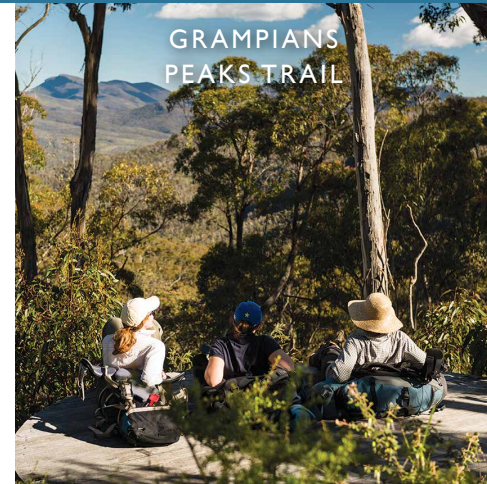
GRAMPIANS PEAKS TRAIL